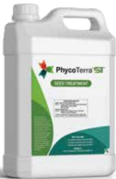
Available in 2x2.5-gallon jugs, 14-gallon kegs and 250-gallon totes.